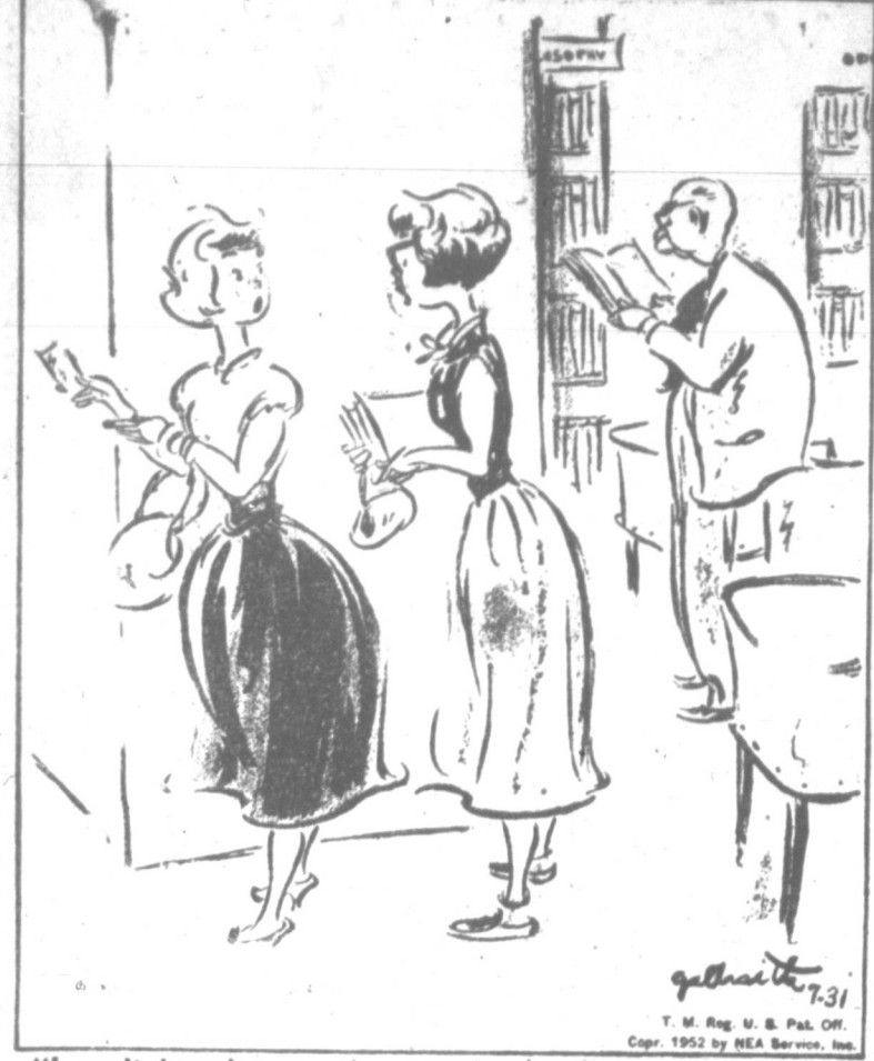
"I can't imagine meeting you in the library! Don't you know that people who come here in summer want to look at books?"