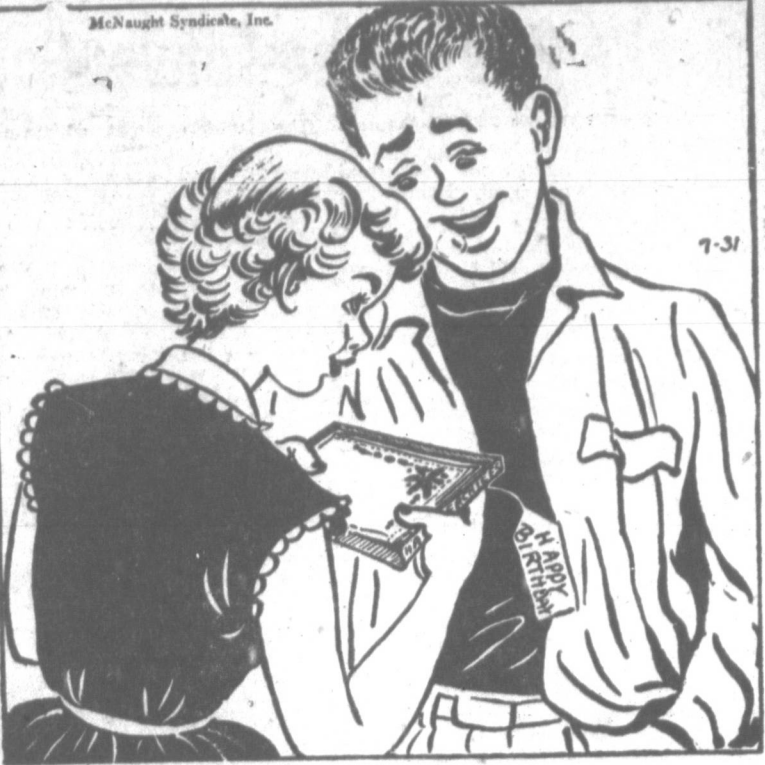
"I was going to get you some of that five dollar perfume, but then I figured it was the thought that counts"