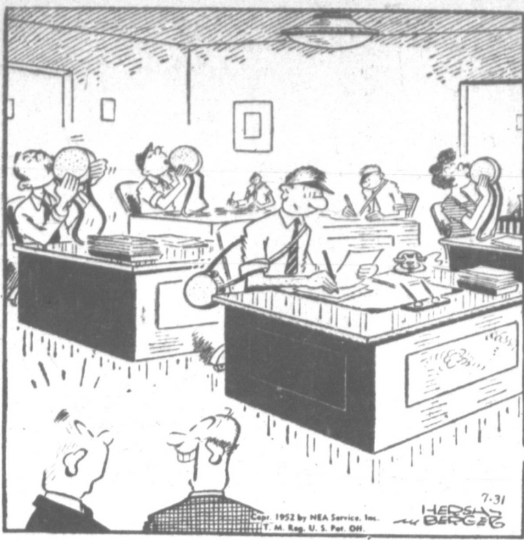
"We equipped the help with canteens to eliminate the continual running to the water fountain!"

allowing West to take his king trump, and this rode around to declarer's hand. Now South could lead a spade from his own hand, and finesse dummy's jack. East could win with the ace of spades, but was unable to defeat the contract. When he returned a diamond, declarer then ruffed a spade spades and second diamond in his own hand, to win the last trick. two tricks with the high trump and the last club. When this hand was played at the other table the declarer ruffed the second diamond with a low trump, and tackled the trump suit by laying down the ace and queen. West took the king of hearts and led a third trump, after which South was unable to make his contract. The defenders were bound to get the ace of clubs and the king of spades.