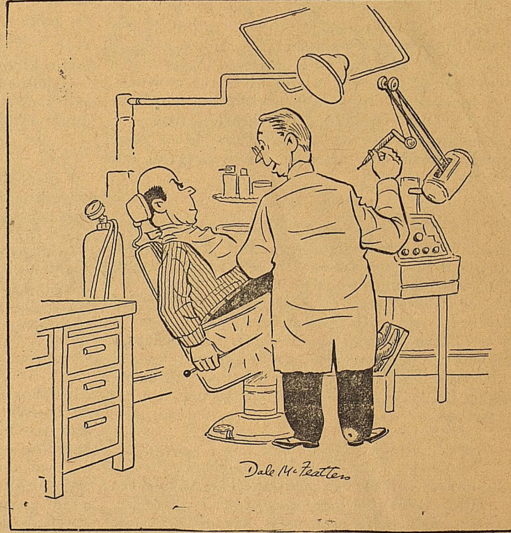
"Let me know when I hurt you!"