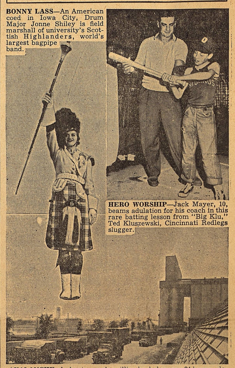
AVALANCHE of wheat—nearly million bushels every 24 hours—descends on Chicago in harvest "wheat run." Tall storage bins of this giant Cargill elevator—one of world's largest—receive wheat simultaneously from "long grain line;" of trucks and from river barges (at left), taking it in on high-speed conveyors and dump chutes.