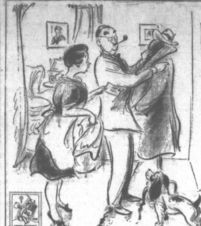
Here's a notice our automobile insurance premium is due—you'd better pay it today because Bill will be home next week on shore leave!