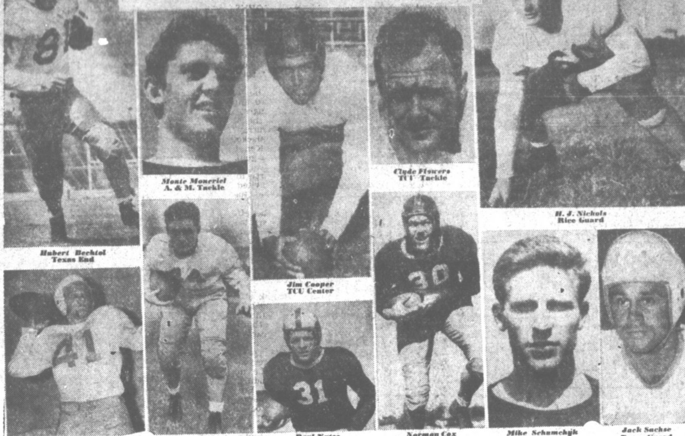
Associated Press 1944 All Southwest Conference Football Team

DALLAS, Dec. 5—(AP)—Only two teams in the Southwest had service football this season but that didn't make the selection of an all-star team any easier.