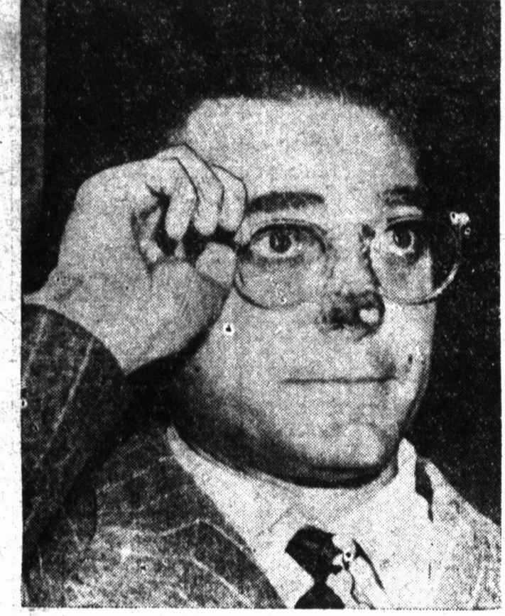
A witness testified yesterday in a Los Angeles court that Mrs. Tommy Dorsey clipped movie idol Jon Hall's nose with a seven-inch butter knife during a free-for-all at the Dorsey home several weeks ago. Hall is pictured above as he appeared in court, patched-up proboscis and all.