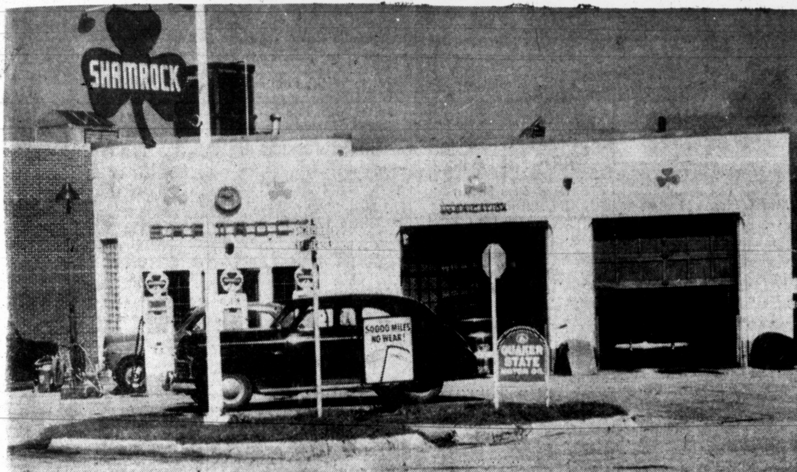
SPRING CHECK UP — Winter will be long gone before you realize it and your car will need that extra push that the demands of spring driving demands. Charlie Ford's Shamrock Service Station, 400 West Foster, is headquarters for courteous, reliable service.

The check up your car needs will be taken care of by competent personnel in well equipped station. Quality products and attention to detail are stressed here.