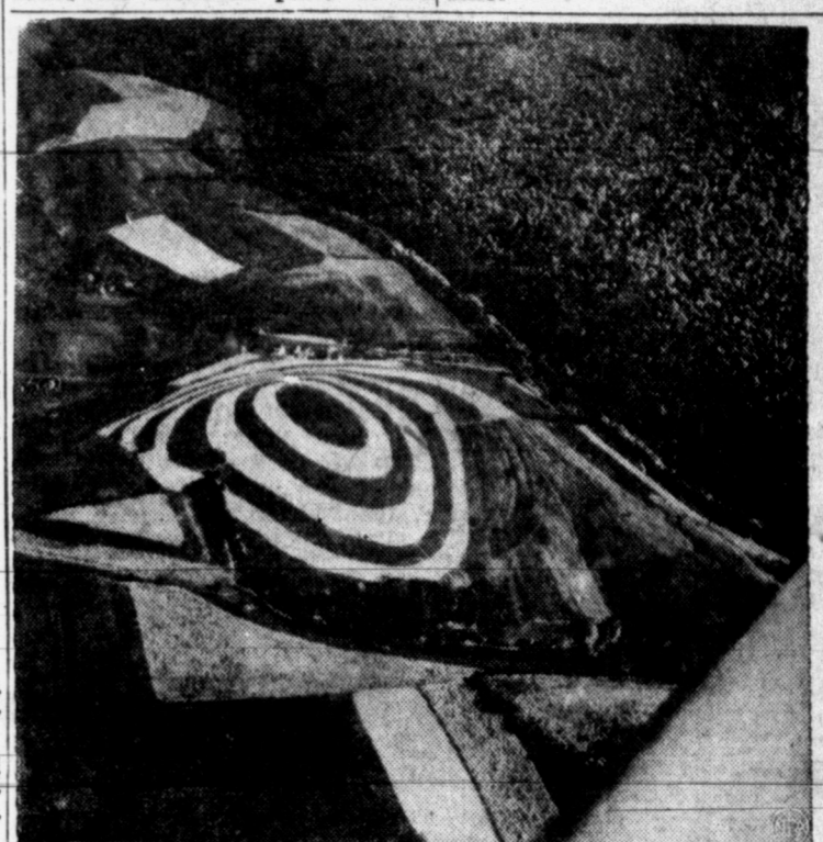
TARGET FOR TONIGHT? —One man's pattern of contour farming produced this irregular bull's-eye in a field north of Allentown, Pa. From this air view, it is obvious that the farmer's work had him going around in circles.