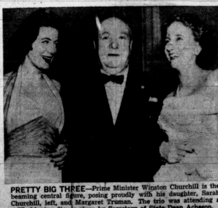
PRETTY BIG THREE —Prime Minister Winston Churchill is the beaming central figure, posing proudly with his daughter, Sarah Churchill, left, and Margaret Truman. The trio was attending a Washington dinner given by Secretary of State Dean Acheson.

"It's Fresherized" The Talk of the Town MEAD'S FINE BREAD IN THE BRIGHT YELLOW WRAPPER AT ALL GROCERS