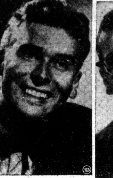
MATINEE IDOL, BEFORE AND AFTER: Off with hair,

NEW YORK --(NEA) -- The $300 mustering-out pay." role of Broadway's top matinee the man who is expected to earn walks and hopes someday to (a) "The first write a novel and (b) own a idol, which was once exclusively $75,000 this year. filled by handsome men with thing I did was to start glamor- farm. distinguished profiles, is now the izing myself."