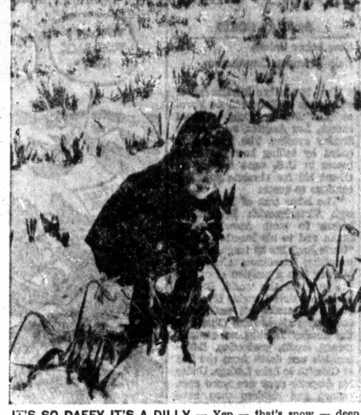
IT'S SO DAFFY IT'S A DILLY — Yep — that's snow — deep snow—and those are real daffodils pushing their way through it. Little Jennifer Sconce admires the determined plooms which are being grown for the annual Puyallup, Wash., daffodil festival.

reconversion and building pro-gram including a 57,800-ton car-rier able to launch atomic bomb-rier able to launch atomic bomb-Say Women Superior