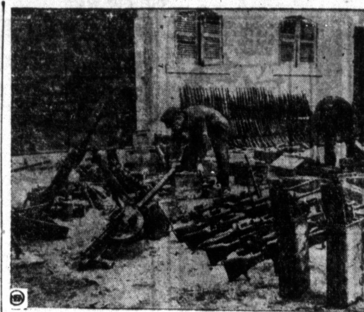
UNCOVERED ARMS: Police check through a 14-ton arsenal of

"The biggest mistake these by films make," he said, "is show-