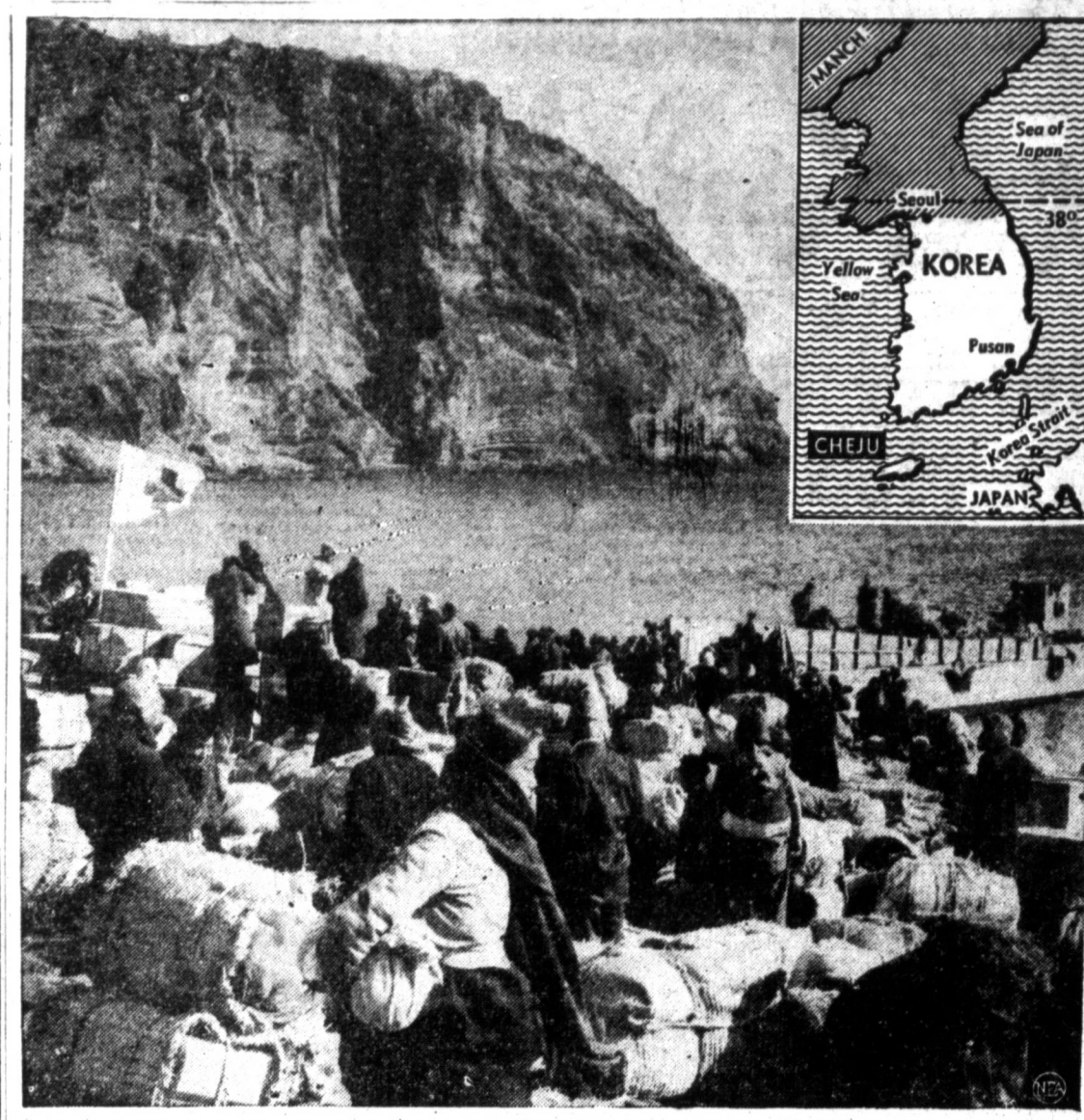
HAVEN FROM WAR-The flag of the Red Cross flies over a harbor aid station as weary refugees from the Korean war pour ashore at the island of Cheju. Inset map shows location of the mountainous little island 75 miles off the south coast of Korea, where some 70,000 war-displaced Koreans have sought refuge. Over 1000 Korean orphans have been airlifted here where they are under United

STARTS TOMORROW Road Show Forbidden Women'