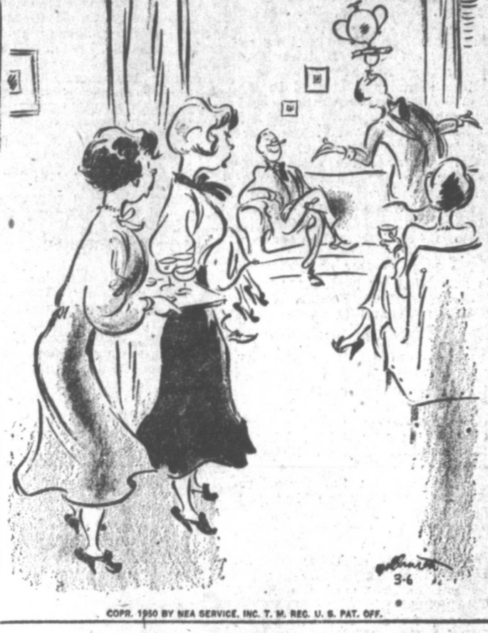
"Good afternoon, madam! Did a party at this address advertise in the paper for a traveling companion?"