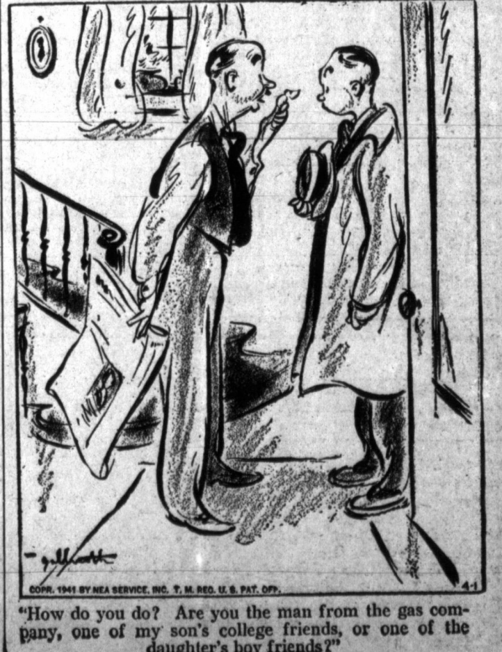
"How do you do? Are you the man from the gas company, one of my son's college friends, or one of the daughter's boy friends?"