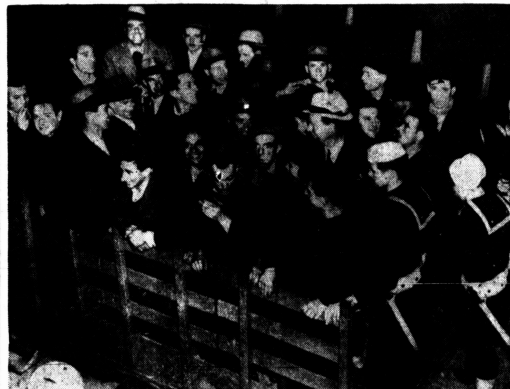
Seizure by United States guardsmen of the Italian-Owned Mongiola at the Houston, Texas docks caused no hard feelings among the crew as evidenced by the grins of the sailors as they were hauled away in a truck.