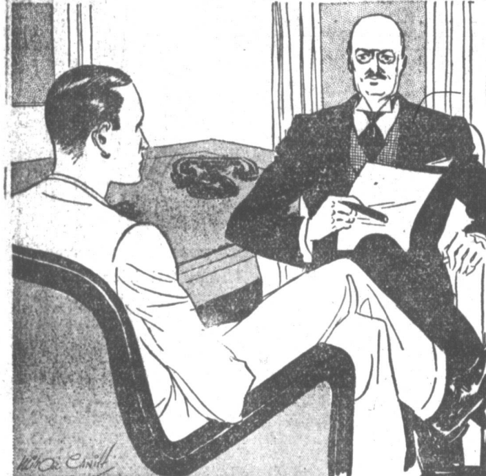
"Whose estate do they handle?" asked Clive.

"Well, don't act rashly. Ten thousand a fine salary. If you turn them down, which I shouldn't think is likely, keep in touch with me. We might come to an arrangement." For a few more minutes Mr. Cleasby detained him. "How's the marriage?" "Couldn't be better."