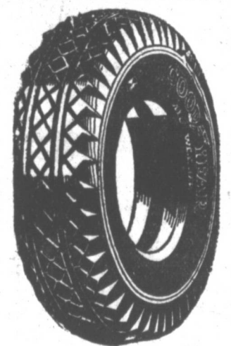
FIGURE it out for yourself! If your tires are pretty smooth right now, the slippery roads of Fall and Winter make the full grip of new Goodyears a sensible precaution. . . And new treads last three times as long on cool roads as on hot summer roads. So Goodyears put on now will still be practically as good as new for next spring and summer. You'll be protected from skids and free from expense and worry of tire trouble all Winter. Better Buy Now!