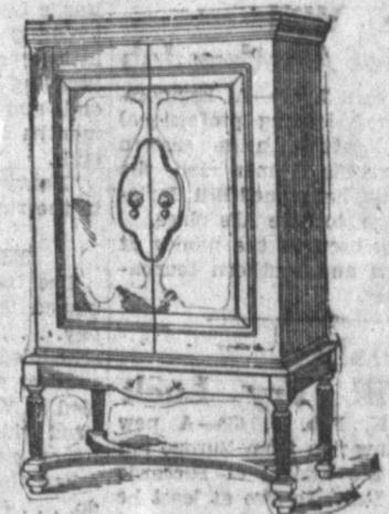
Model C-2 Radio and Electric Phonograph, Price, including Dynamic Speaker, less tubes: $69.95.