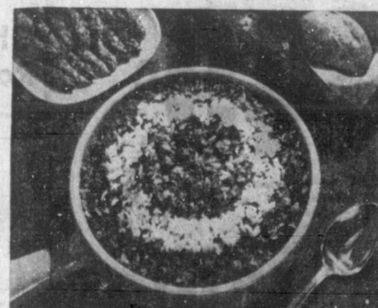
THIS UNUSUALLY flavored Bali Beef Casserole will be a standout at any informal supper. Ground beef joins with rice, cooked tomatoes, curry powder and other seasonings for a novel taste adapted from the East Indies.