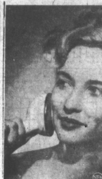
Electrical vibrator is new appliance which combines heat and massage for home facial.

Award of Mineral Lease Bids Made AUSTIN — (AP) — Award of mineral lease bids on 33,833 acres in the protected Laguna Madre area was announced Tuesday.