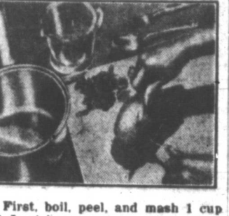
First, boil, peel, and mash 1 cup of Louisiana yam sweet potatoes.

Yam Spice Cake 1 cup sifted all-purpose flour 1/2 cup sugar 1/2 cup margarine 1/2 cup mashed Louisiana yam sweet potatoes 1/2 cup chopped nut meats 1/2 cup seedless raisins 1/2 cup milk