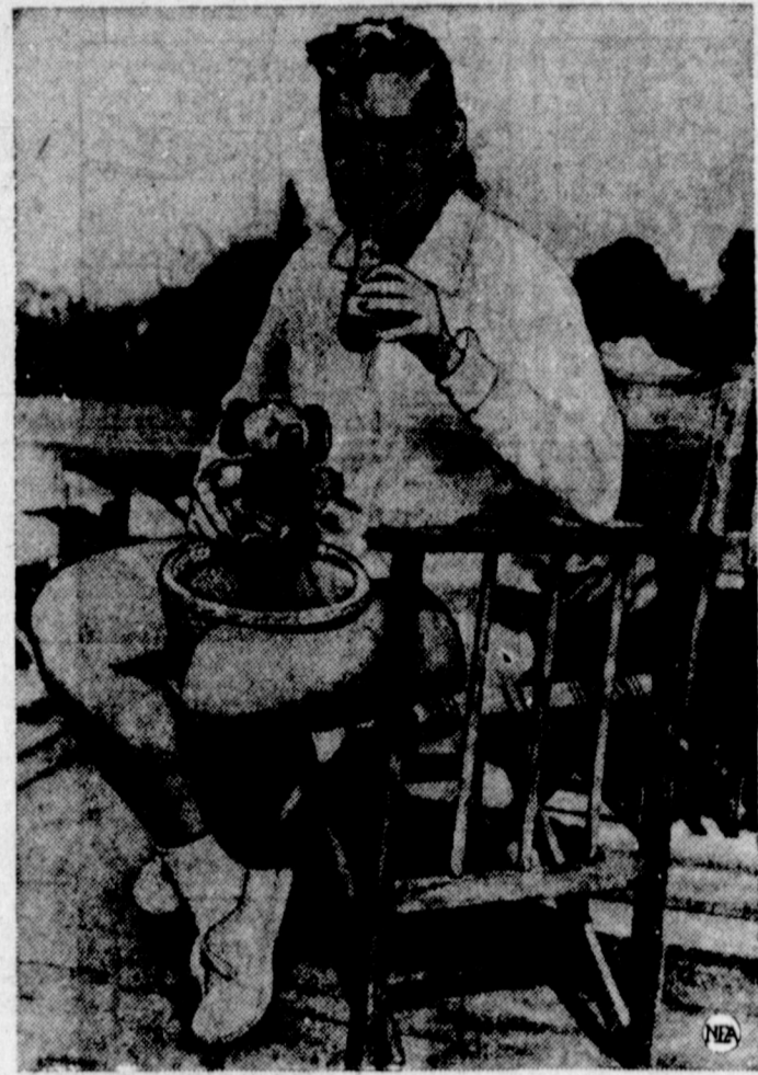
HARD WAY — Darlene Hard failed to repeat her 1956 singles victory in the Sutton Hard Court Championships in England, but the Long Beach lass went to the final match, Miss Hard relaxes with a cooling drink.