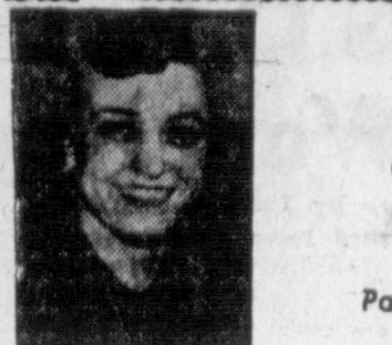
Pampa News Women's Editor