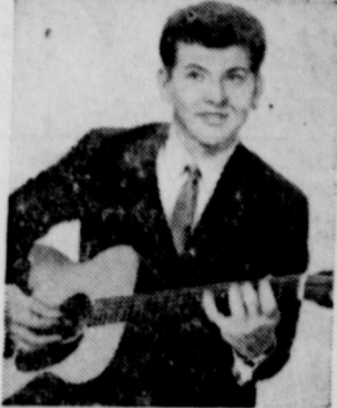
JIMMY CLANTON SINGING SENSATION OF "TEEN AGE MILLIONAIRE" MUSICOLOR

"Teenage Millionaire," the musical-comedy opening today and Monday at the Majestic Theatre, through United Artist release, features, for the first time, a unique method of color printing with a wide-screen process. Called "Musicolor" this tinting is used throughout the film to enhance the various moods of music performed by Jimmy Clanton, Chubby Checker, Dion, Bill Black's Combo and a host of top teenage music stars. Although there are 20 musical numbers in "Teenage Millionaire."