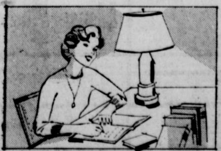
For best light from a table lamp, use a 150-watt bulb. A diffusing bowl is recommended to prevent glare.

You'll be giving your youngsters real help with their homework when you provide them with proper study light. Good light helps prevent eye fatigue ... aids concentration ... encourages good study habits that lead to better grades. Check your children's study light now. Make sure they have enough light and the right kind of light for easy, comfortable seeing.