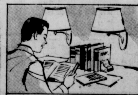
Two wall lamps with 100-watt bulbs in diffusing bowls may be used when study table is placed against a light-colored wall.

TEXAS ELECTRIC SERVICE COMPANY F. N. SAYRE, Manager Phone MA 9-2651