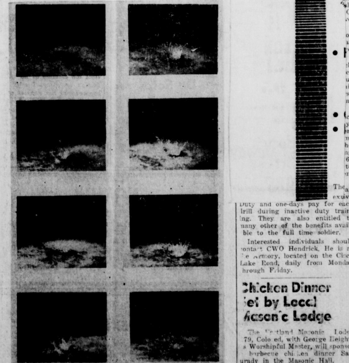
A SINGLE DROP—Series of high speed photographs showing the effect of a single raindrop striking bare ground covered with a thin film of water. This explosive action of billions of individual raindrops is the destructive process that detaches soil particles to be either carried off in runoff water or to clog the natural pores of the soil.