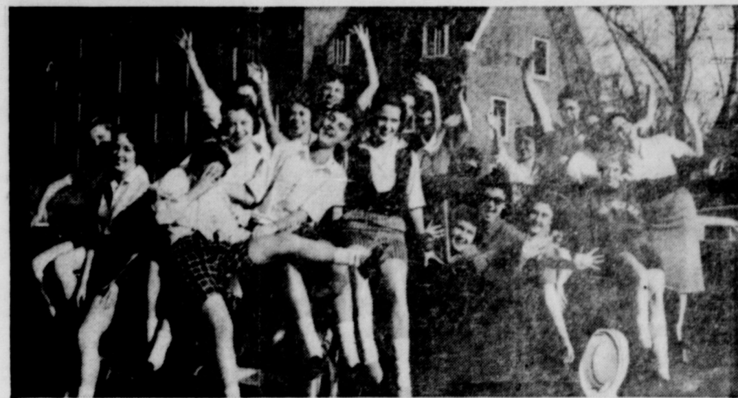
ROOMY ON THE INSIDE, TOO—University of Tennessee coeds number 15, 16, or 17, depending on how your counting is these days, on the OUTSIDE of this car. INSIDE, there are 13 addicts of the current crowd-'em-in college craze. This manifestation of fevered spring occurred in Knoxville, Tenn.