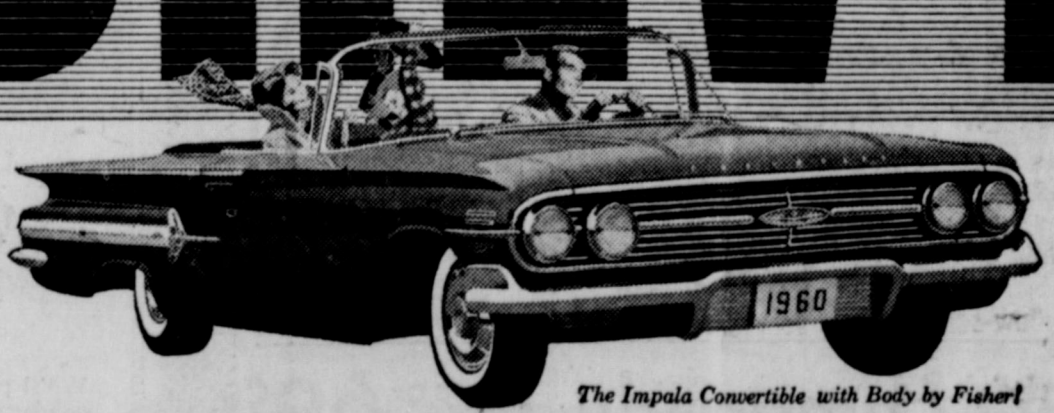
The Impala Convertible with Body by Fisher!

Why shouldn't you be driving America's first-choice car right now? You couldn't do better by your family—or your family budget—than to pick out one of Chevy's 18 FRESH-MINTED MODELS, load up its VACATION-SIZED TRUNK and take off on one of those springtime trips Chevy so dearly loves. Once you're whisking along the highway, cushioned by FULL COIL SPRINGS at all four wheels, you'll have your own smooth-running account of why Chevy's '60's best seller. And right now when beautiful buys are in full bloom at your dealer's!