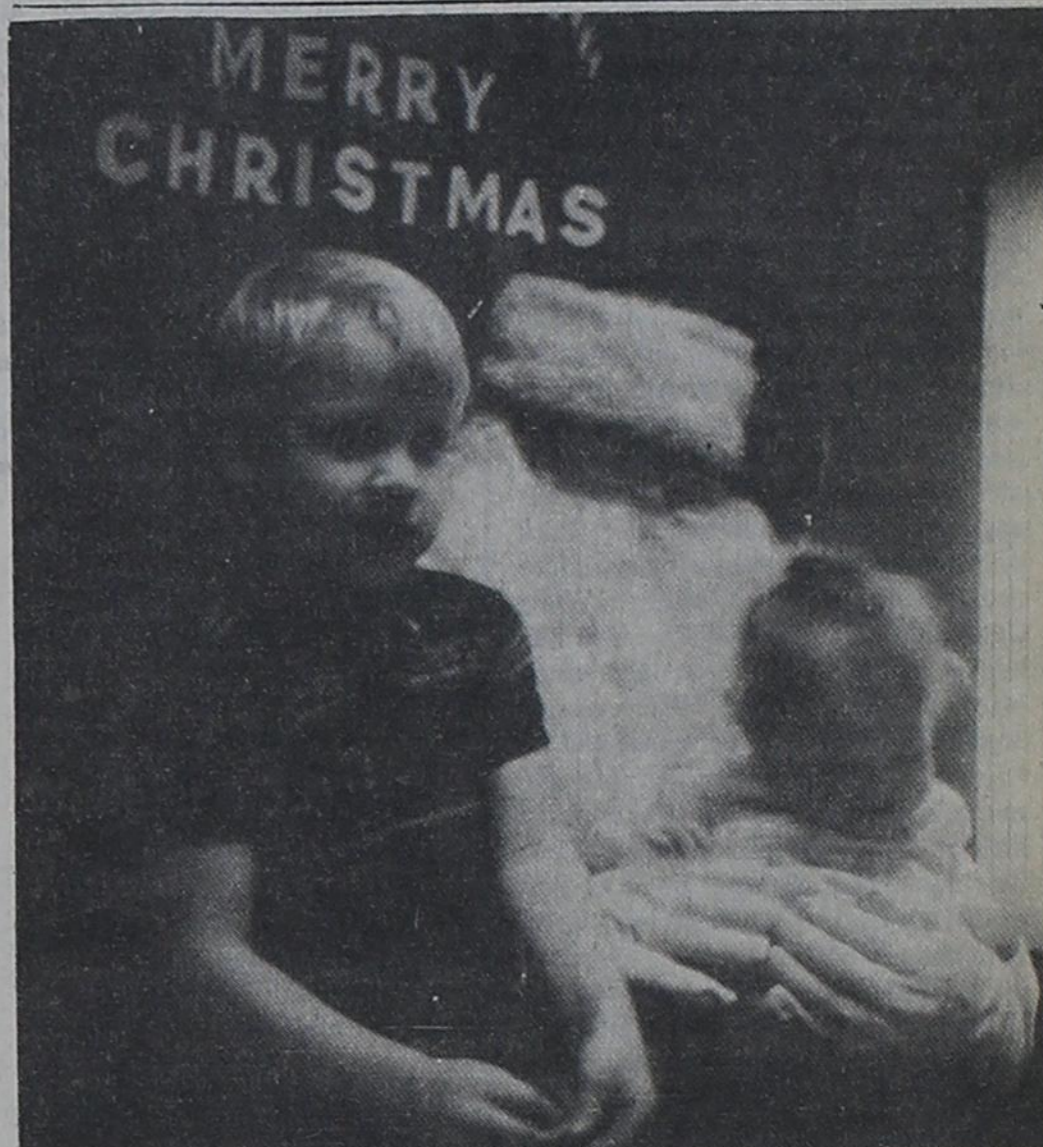
VISITING SANTA: Santa came to Wheeler Saturday afternoon; the trip was sponsored by the Beta Sigma Phi sorority. A large crowd of youngsters

Call 826-3123, or drop by our office. Say "Merry Christmas" to all with a greeting in our Christmas edition.