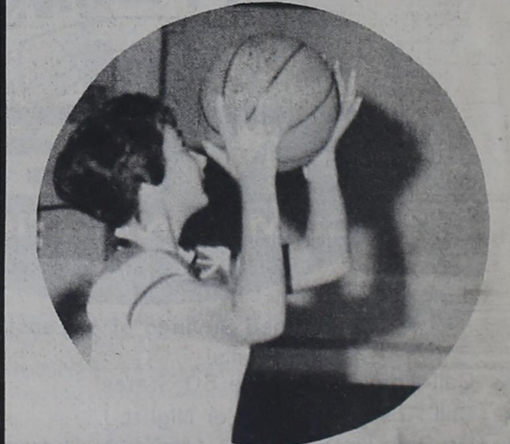
This Star and Jack Benny Are The Same Age