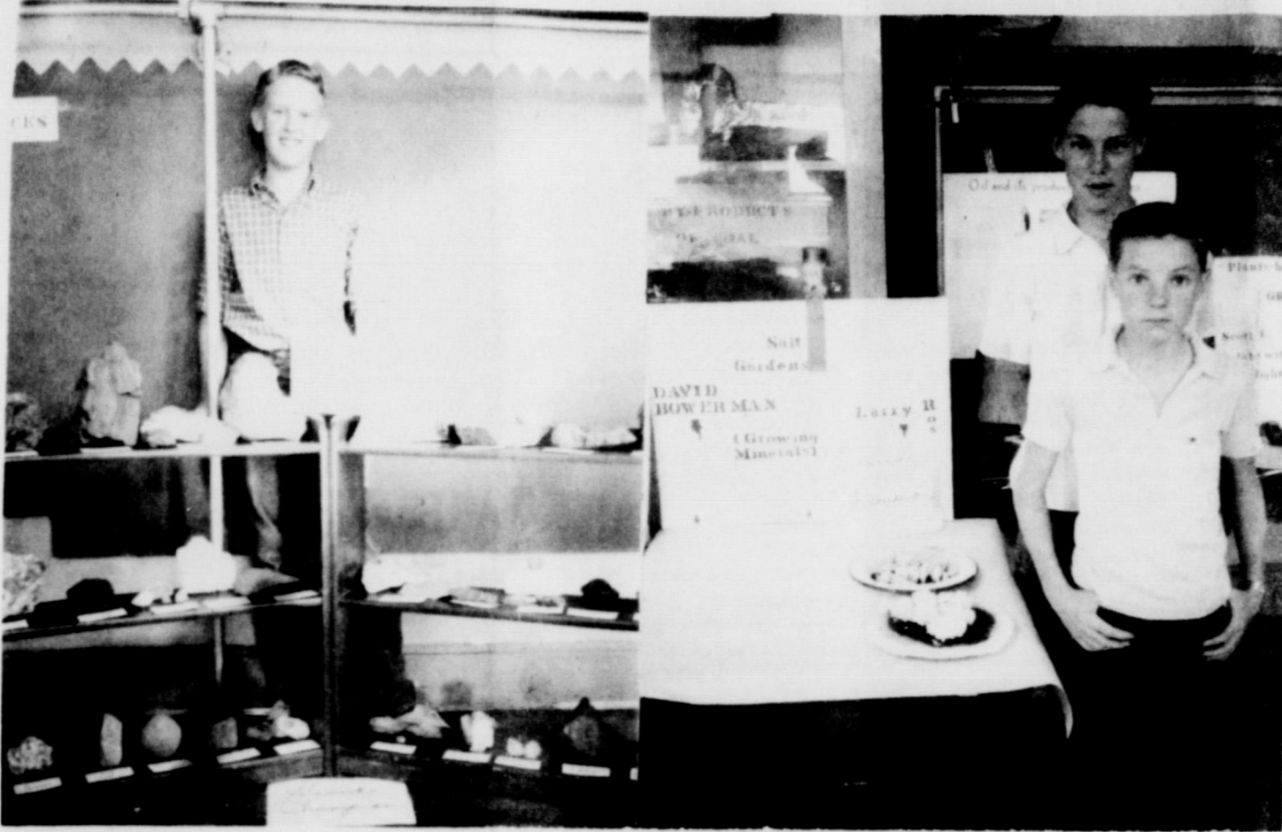
BEST EXHIBITS: These three boys exhibited the outstanding projects at the fifth and sixth grade science fair which was staged in the grade school Friday of last week. Themes of the different exhibits were Weather, Oil Plants and Foods, Insects and Animals, Machines, Gravity, Electricity, Human Body, Air Pressure, Density