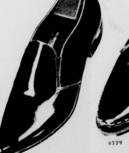
Premium Black Smooth CLASSIC Genuine hand-sewn Swiss-Stitch three-eyelie tie mid-low mac. toe blu. ox. lea. qtr. lining and HP. stitchless topline, flexi single lea. outsole, two-piece rubber heel.