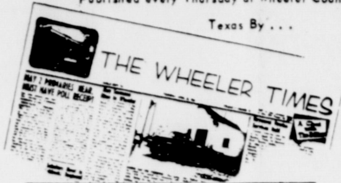
Entered as second-class matter December 16, 1933, at the Postoffice at Wheeler, Texas, under act of March 3, 1879.