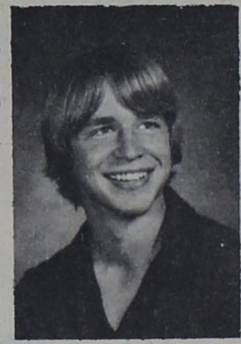
MOBEETIE STUDENT WINS GOES TO STATE