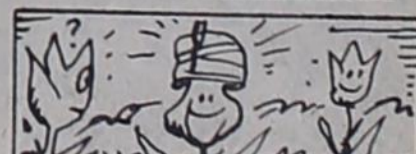
The tulip originated in Central Asia and gets its name from the Turkish word for turban.