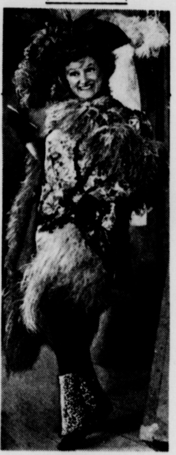
"Did You Hear The One About The Traveling Sales-lady?" You will have the chance Saturday, Sunday or Monday at the Rogue Theatre. The Saturday night preview starts at 10:30. Sunday's Matinee starts at 2:00 p.m. Monday's feature starts at 8:00 p.m.