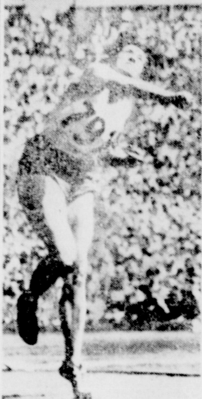
TOSSING the javelin 149 feet, 8 inches, H. Baume, noted Austrian woman athlete, sets a new Olympic record in the finals at Wembley Stadium, London. She won the event abruptly

and levy upon as the property of the above defendants, the hereinabove described property situated in Wheeler County, Texas.