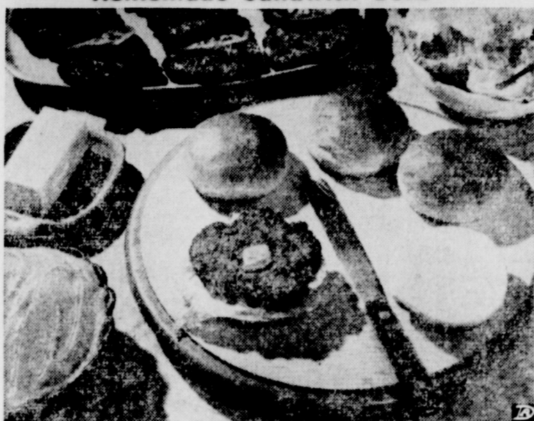
Just plain good food is the keynote of a quick menu of well-done hamburgers on enriched sandwich buns, served with plenty of garden fresh salad.

A serve-yourself meal which features hamburgers and relishes is certain to draw many comments of "what fun this is!" Sandwich buns from the bakery or made at home give the burgers that wonderful special flavor. When made at home, the buns are easily shaped from a plain yeast dough by rolling into small balls and flattening to the desired shape. With the picnic season in full swing, it is a good idea to bake enough buns at one time to take care of sandwich needs for several days. Careful storage preserves their fresh quality. Incidentally, the buns taste wonderful when toasted over an open fire. On other occasions you may wish to let the nearby friendly baker save you time and energy. The enriched sandwich buns he supplies also provide the important B-vitamins and iron of these home-made buns.