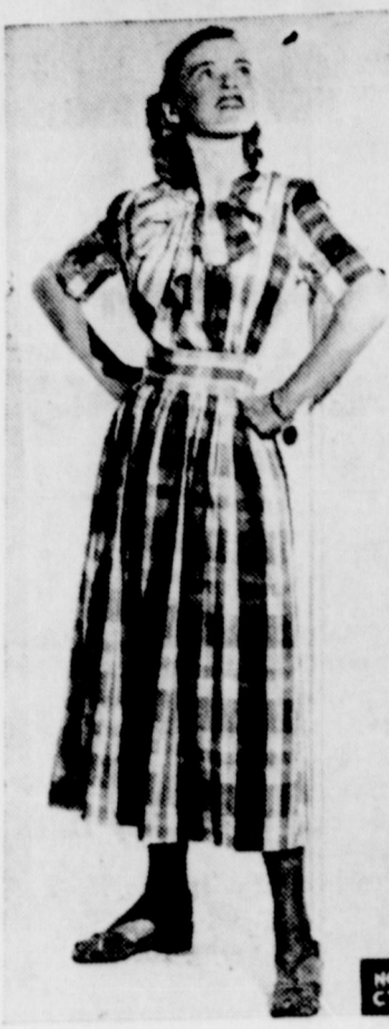
Here's a sample of what style-wise coeds will be wearing when they head back to school. A lovely scholar models a cotton frock for campus wear, designed by Saba of California in plaid cotton by American. The short sleeves, big bow tie at the neck, and set-in-belt area are a nod from the girls.