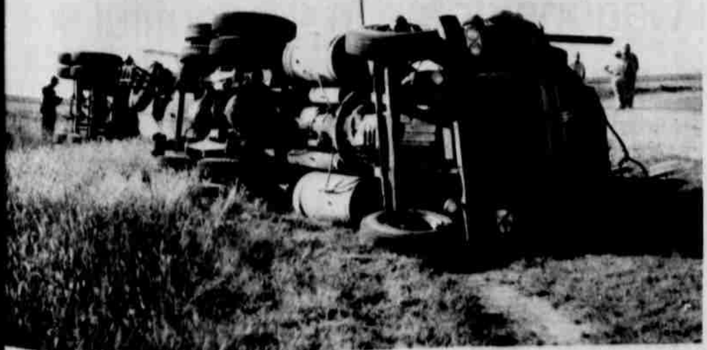
MISSED SHARP CURVE - This huge tractor - trailer unit is shown where it came to rest after missing the sharp curve near the Bula School early Wednesday morning. Extensive damage was done to the tractor unit and the driver, Lawrence Russell of Amarillo was injured. The truck turned over one-and-a-quarter times.