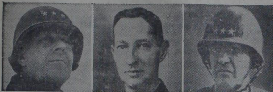
JACOB L. DEVERS MARK W. CLARK WALTER KRUEGER