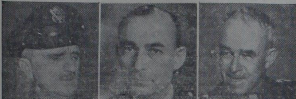
CARL SPAATZ J. T. McNARNEY OMAR N. BRADLEY