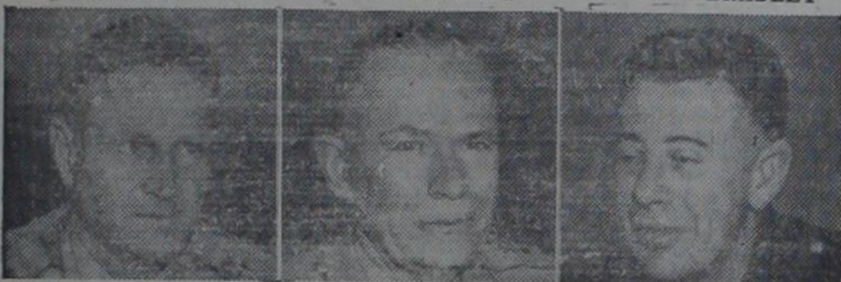
THOS. T. HANDY B. B. SOMERVELL GEORGE C. KENNEY

The above nine lieutenant generals were nominated by President Roosevelt to be full generals in the U. S. army. They are: Jacob L. Devers, commanding general, 6th army group, European theater. Mark W. Clark, commanding general, 15th army group in Italy. Walter Krueger, commanding general, 6th army, Philippines. Carl Spaatz, commanding general, U. S. strategic air force in Europe. Joseph T. McNarney, supreme deputy Allied commander, Mediterranean theater. Omar N. Bradley, commanding general, 12th army group, Western front in Europe. Thomas T. Handy, deputy chief of staff, U. S. army. Brehon B. Somervell, commanding general, army service forces. George C. Kenney, commanding general, Far East air forces.