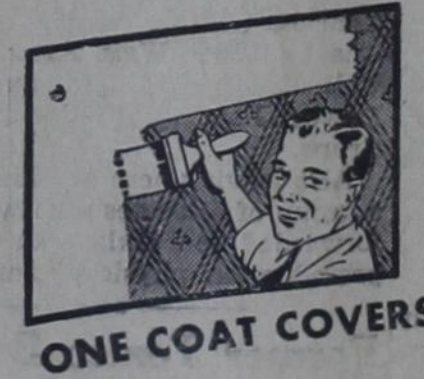
ONE COAT COVERS

BEAUTIFUL COLORS THAT DRY QUICKLY SO YOU CAN USE THE ROOM THE SAME DAY NO OFFENSIVE ODOR