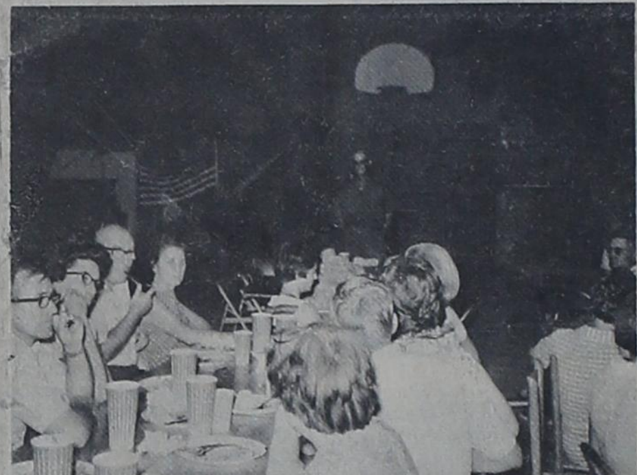
A PART of the crowd at Oklahoma Lane July 4th celebration and picnic is shown as they enjoy the food which was so plentiful and delicious.