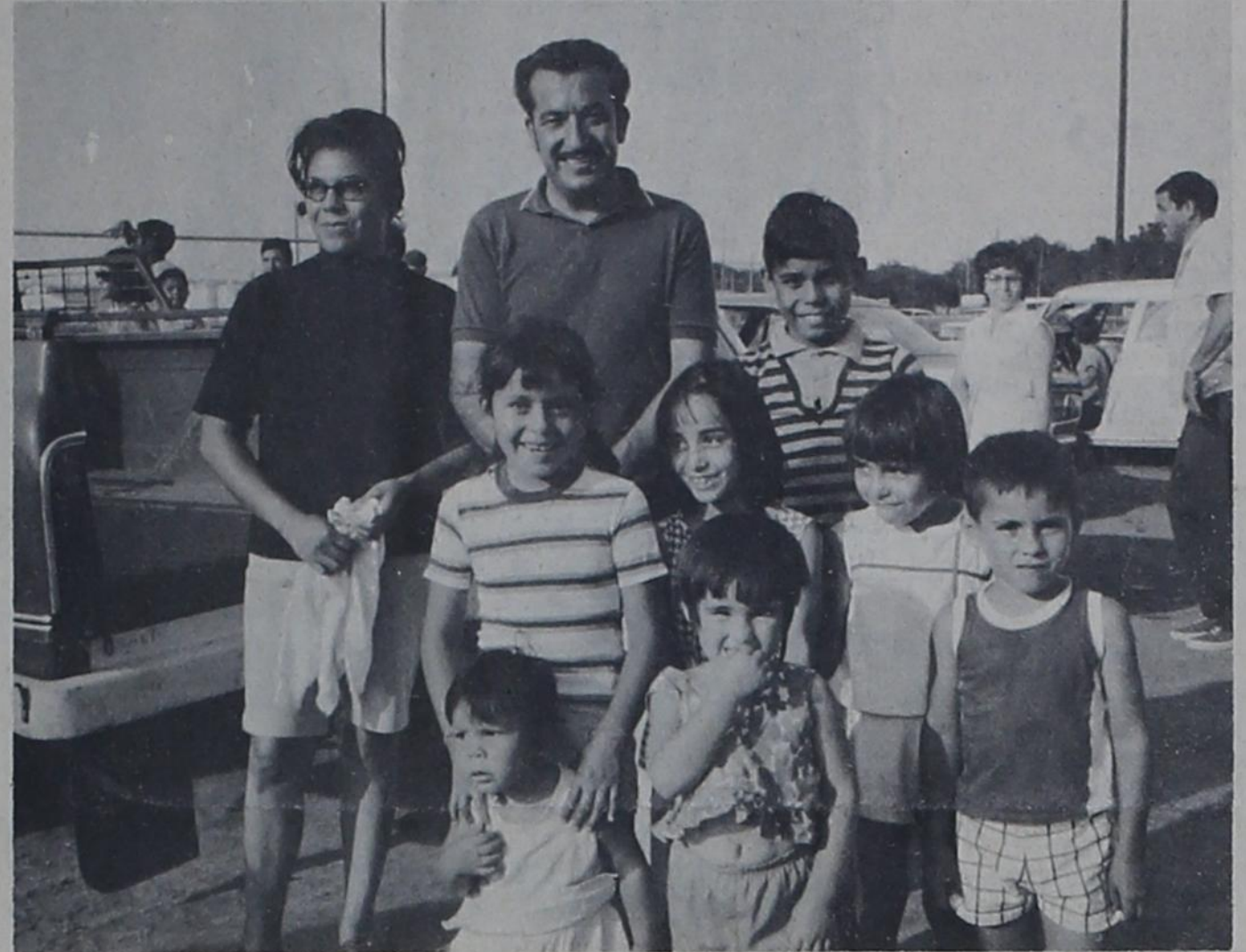
BARBECUE CON FRIJOLAS with all the trimmings, along with baseball games and a gigantic fireworks display was on the agenda for this typical family who attended the July 4th festivities in Texico last week. Some 500 persons witnessed the fireworks display which climaxed the afternoon and evening of festivities.