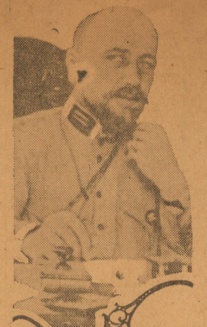
War Minister Petroff.

War Minister Petroff of Ukraine is the man charged with being respon- sible for the issuance of pogroms against the Jews in that country. Jewish people all over the world are stirred to a high pitch at this time by reports of the persecution of their people in Ukraine. Poland and other states in Europe. Protest meetings and parades are being held through- out the United States to arouse the sympathy of the public and halt the persecutions.