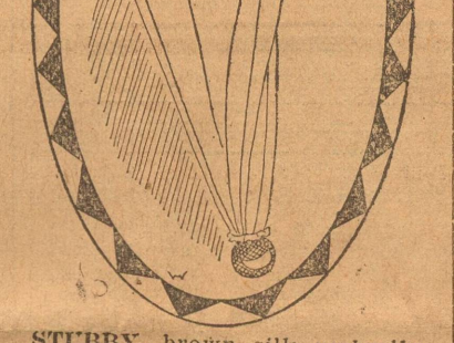
STUBBY, brown silk umbrella with a huge handle of nacre and a smaller pearl at the tip.