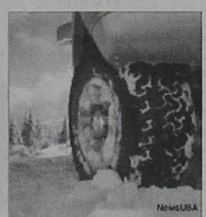
If you live in an area that is prone to snow and ice, you might want to install

· Be on the defensive. Take a defensive position against winter of your tires. Once it gets cold,