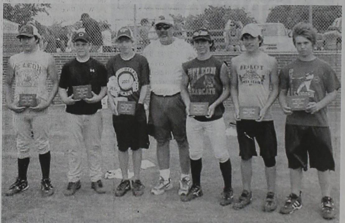
Old Timers Group