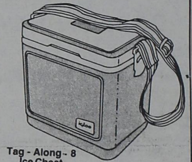
Tag - Along - 8 Ice Chest

10% OFF on All Other Igloo Products, While Supply Lasts.