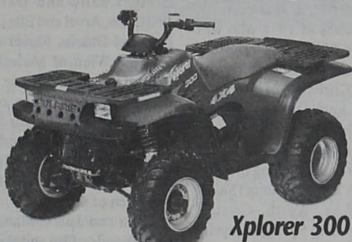
Xplorer 300 4x4