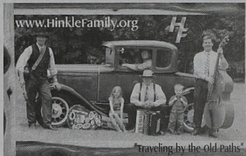
Gospel singing in Moran on November 29 at the Country Gospel Church starts at 3:00 pm Banquet to follow Concert Free Banquet $6.00 Everyone Welcome