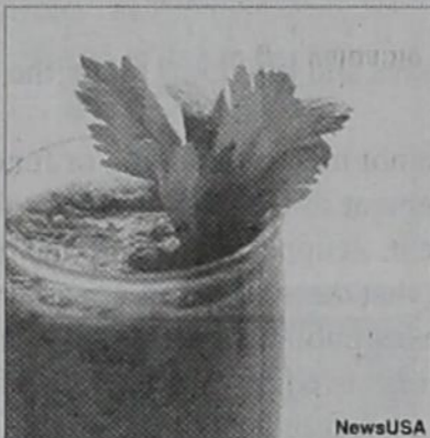
Green smoothies are a delicious way to get valuable nutrients from fruits and vegetables.

Green smoothies are best when completely smooth, so choose the top blender available to pulverize completely. The Vita-Mix 5200,