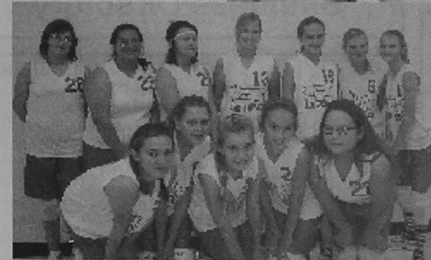
Seventh Grade Volleyball Team