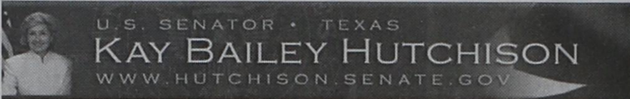
U.S. SENATOR • TEXAS KAY BAILEY HUTCHISON WWW.HUTCHISON.SENATE.GOV

For Pool Sales & Service - Call 254-965-4145