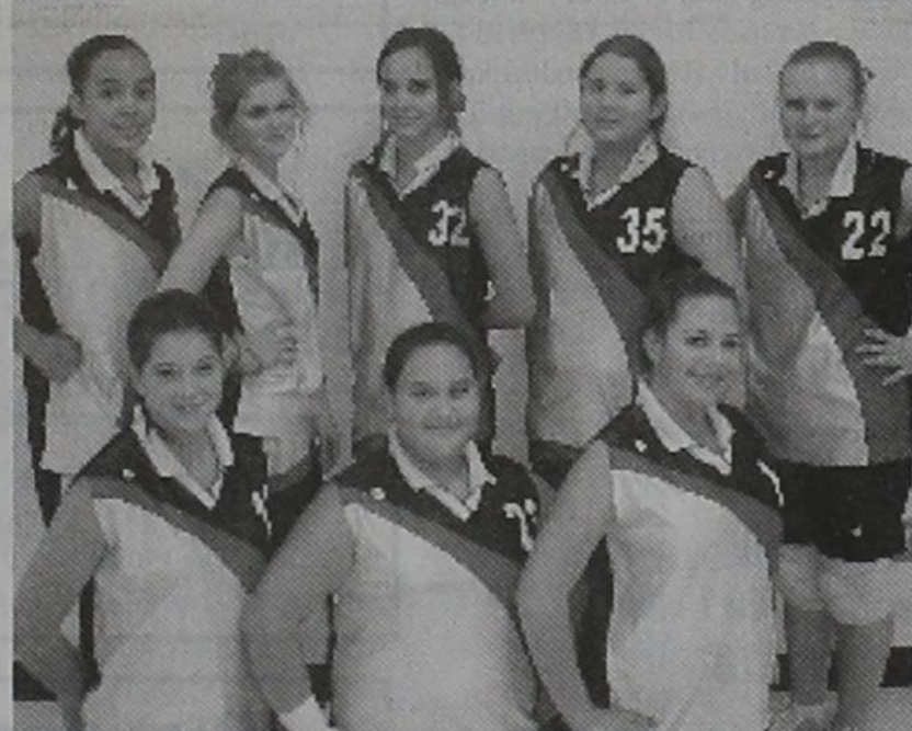
Eighth Grade Volleyball Team

The Lady Cub Volleyball team did a fantastic job this volleyball season. The girls worked very hard to master the basic fundamentals of the game. They worked well as a team and pulled out several wins. Their serves and passes got consistently better throughout the season. This team will be fun to watch the next several seasons.