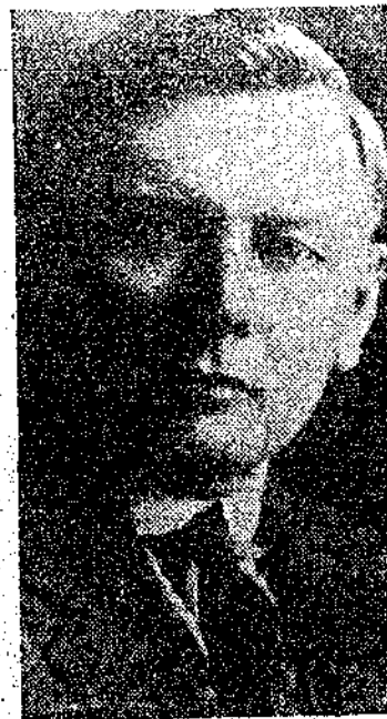
R. S. STERLING Houston Candidate for Governor

Explanatory Note.—The estimated reduction in the tax rate has been calculated in accordance with the best available information. The exact figure will depend upon varying conditions in each county. But that a material reduction of the ad valorem taxes would be affected under the plan is certain.