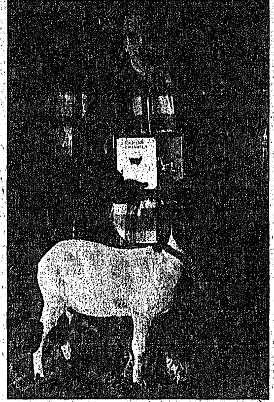
Boone Cook had the grand champion and reserve grand champion market goat in the Santa Anna livestock show.