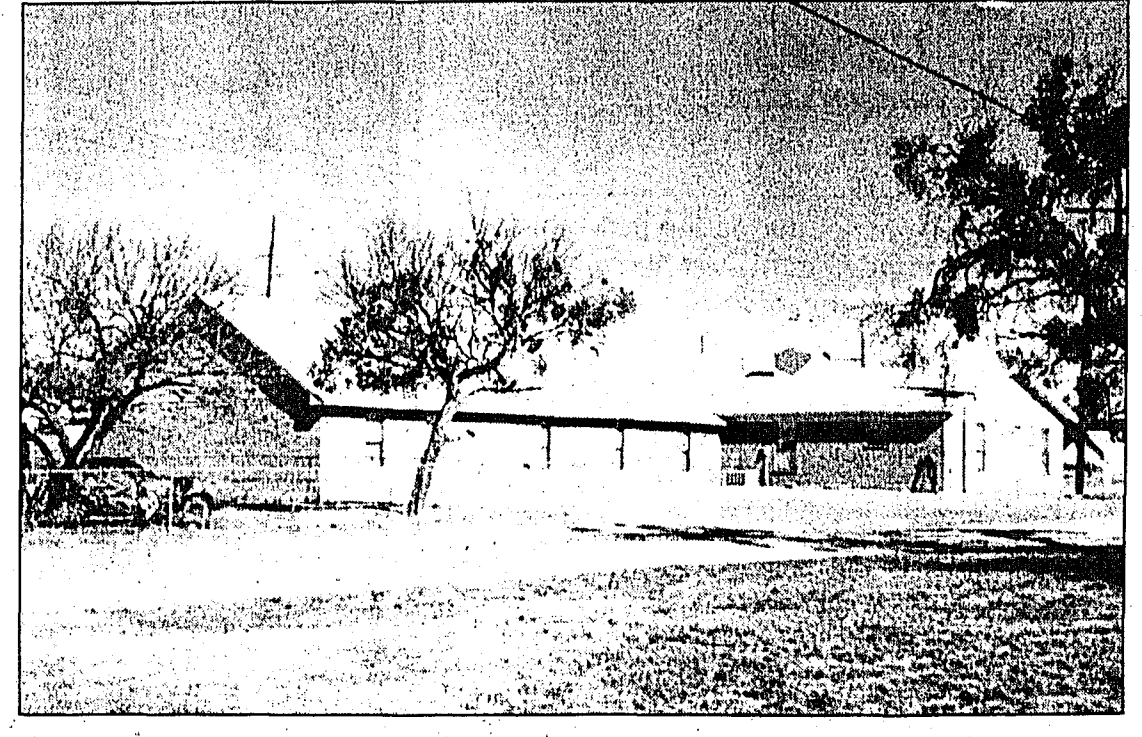
El Cordero Baptist Church with original building at right with steeple. Extension at left is new addition.

In addition to ministering to the Hispanic community in Santa Anna, El Cordero members take an active part in the Coleman County Baptist Association and have involved First Baptist Church and other county Baptists in a mission project to help support a home for orphan children in Piedras Negras,