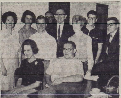
OFF TO NEW MEXICO-These members of the Board of Student Organizations are on retreat this weekend at Bishop's Lodge in Santa Fe, N.M. The BSO trippers leave