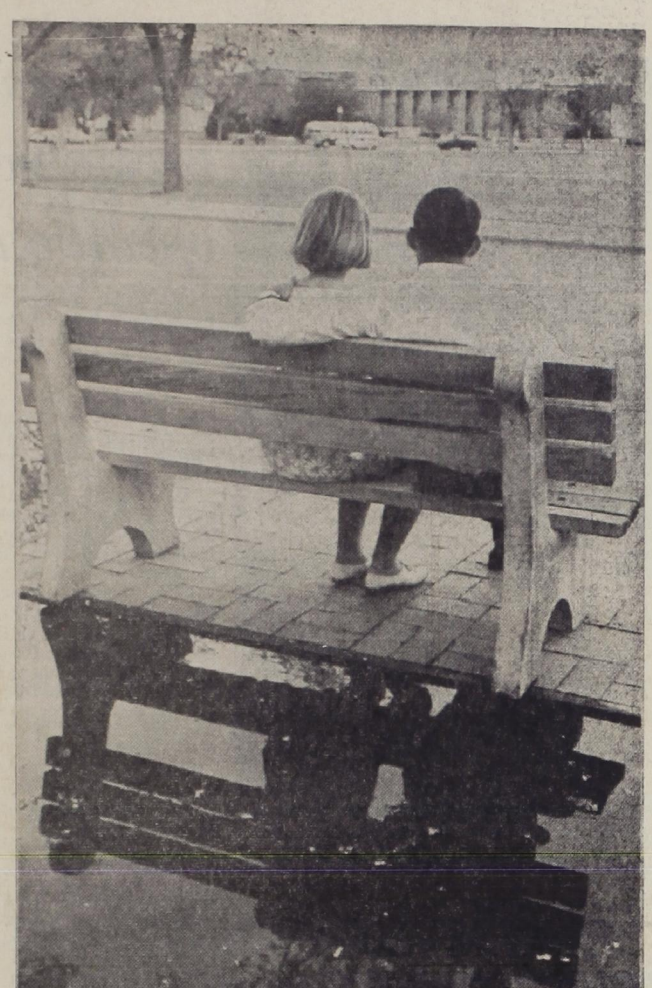
JUST SITTIN' AND LOOKIN' TIME AGAIN