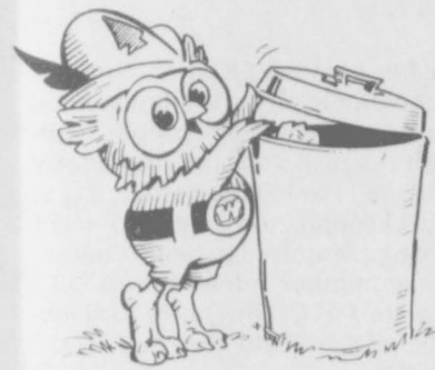
Woodsy Owl says Stash Your Trash