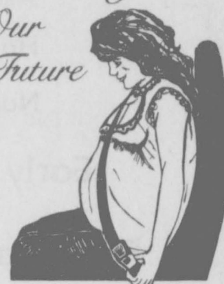
Texas Coalition for Safety Belts