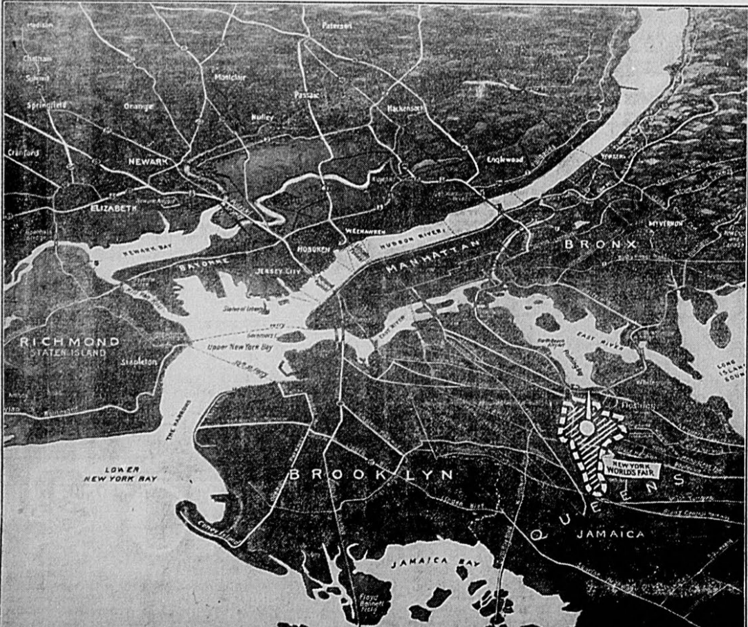
Aerograph showing main highways which lead from New Jersey, New England, Westchester and Long Island to the grounds of the New York World's Fair 1939 in the heart of greater New York City. Tunnels, bridges, ferries, airports, water gates—all are indicated.