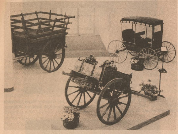
These are some of the carriages on display with the Sterquell collection.

AMARILLO -- Smiling senior citizens stroll through the newly open Sterquell Collection of Horse-drawn Vehicles,