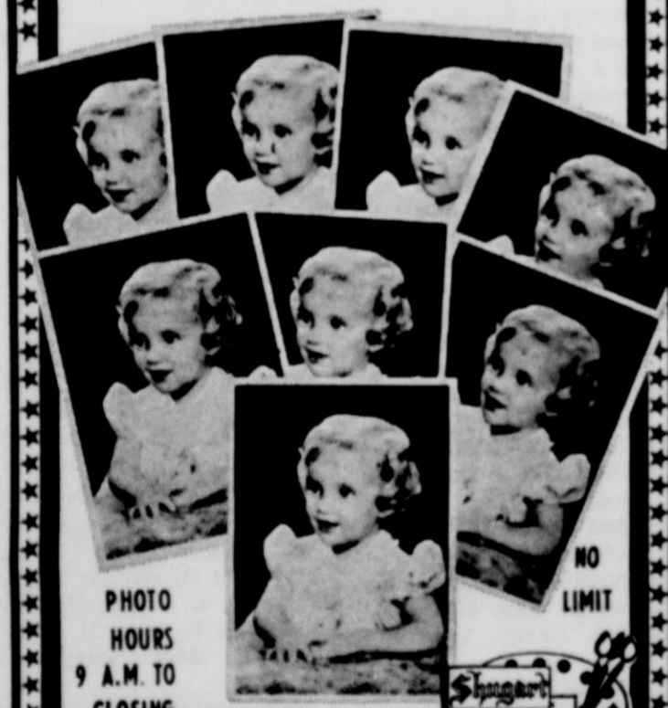
PHOTO HOURS 9 A.M. TO CLOSING

FREE SPECIAL BONUS THIS TIME ONLY 25 STAMP SIZE PHOTOS WITH PURCHASE OF OUR REGULAR SPECIAL 8 KING SIZE WALLET TOTAL OF 33 PHOTOS FOR 99c