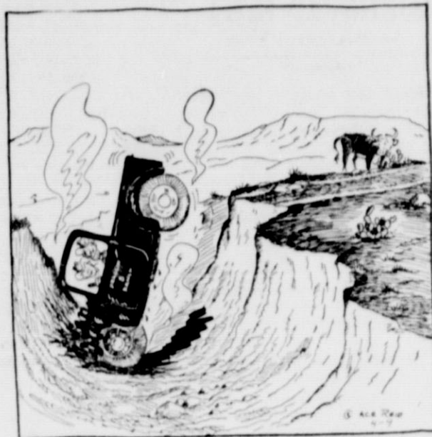
Dang it Jake, you tore up a $2000 truck just a lookin' at a $80 cow.

This feature sponsored by THE FIRST STATE BANK