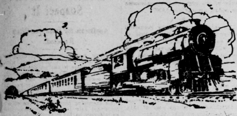
Out of accumulated capital have arisen all the successes of industry and applied science, all the comforts and ameliorations of the common lot. Upon it the world must depend for the process of reconstruction in which all have to share. —JAMES J. HILL