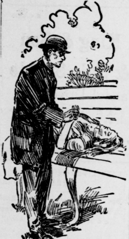
Gently Pressed Back the Stiffening

yellow half hidden by an overhanging tree. Carefully I parted the branches. Sure enough, submerged in six inches of water, were more of the yellow scraps. I waded in and, scooping them up carefully in my hands, laid them on the grass to dry, for they were all but falling apart and I hardly dared handle them. Meanwhile I continued my search for other yellow scraps-this time without avail. If she had carried a torn-up letter with her as she sprang to death, the other