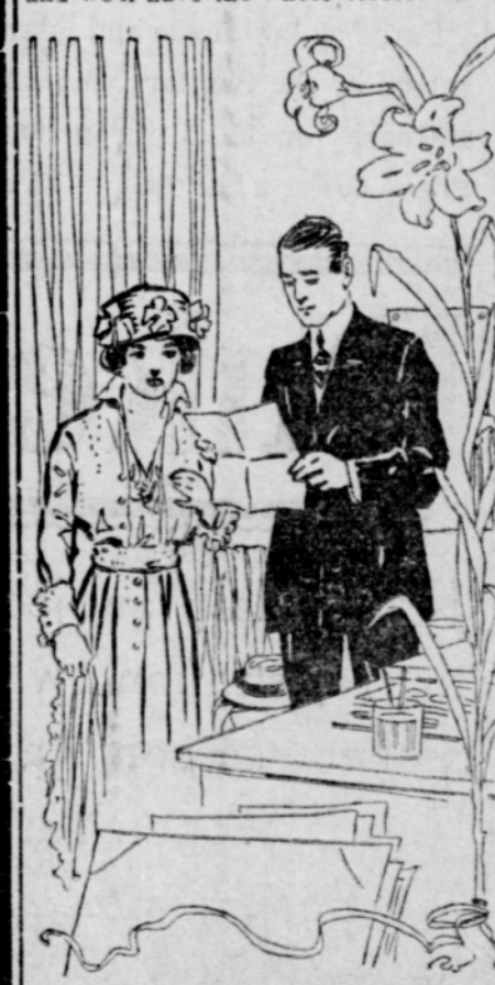
Tore It Open and Read the Words.

"Oh," she breathed, "I do—I do." "And you'll marry me after Easter and we'll have the whole blessed choir