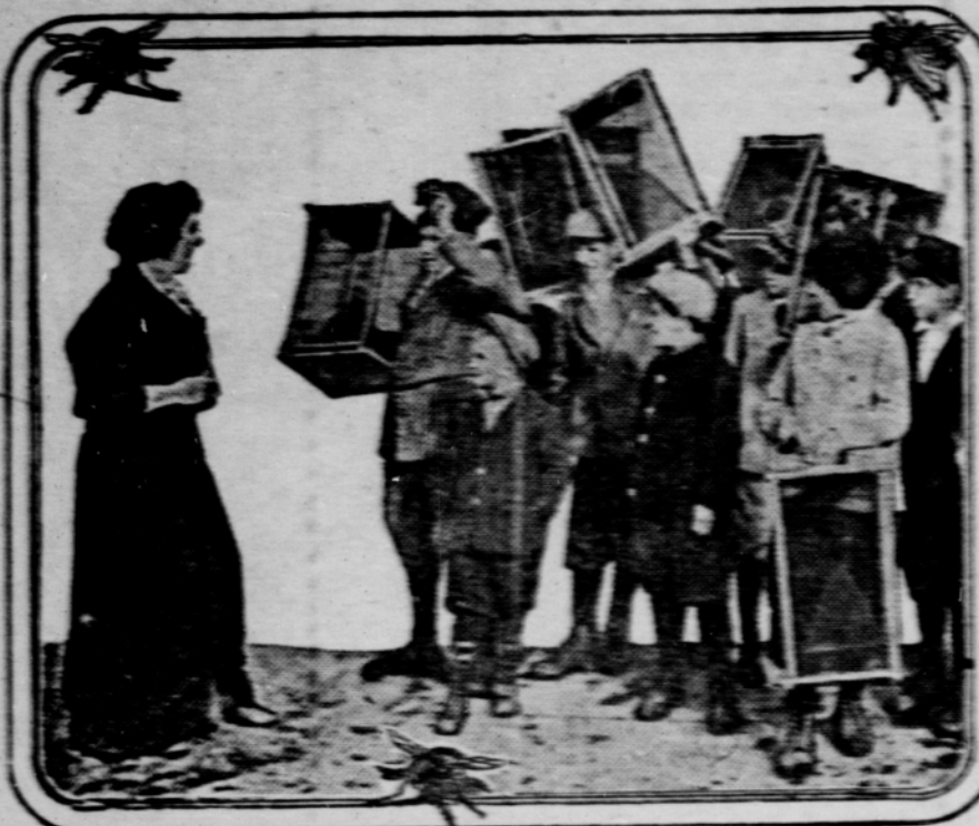
The teachers in one small-town school in Illinois aroused the interest of their pupils in the campaign to kill flies last spring. The youngsters made traps and sold them to the merchants for a neat profit on each trap. This profit was devoted to a fund for the Boy Scout troop. The kids are planning to do a "big business" in traps this season.