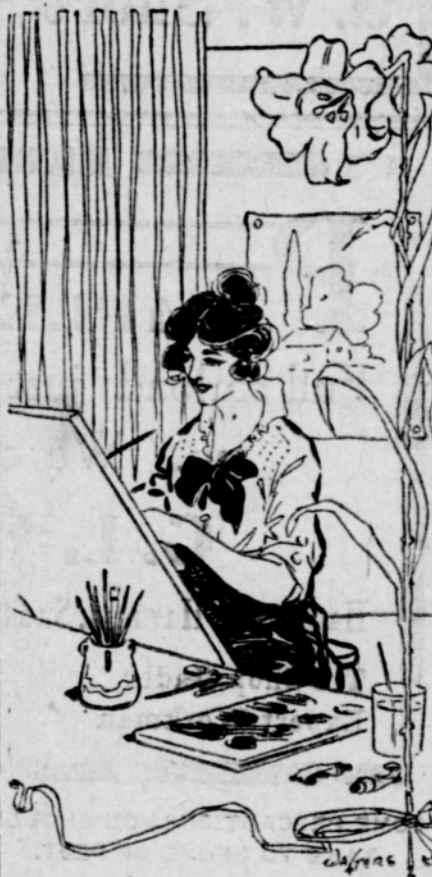
Easter Brought Much Work.

It was the week before Palm Sunday and Easter day that found the little French girl nearly exhausted. A boat had arrived bringing her letters and papers from her home in the suburbs of Paris. She picked up her mail and went to church for a rehearsal.