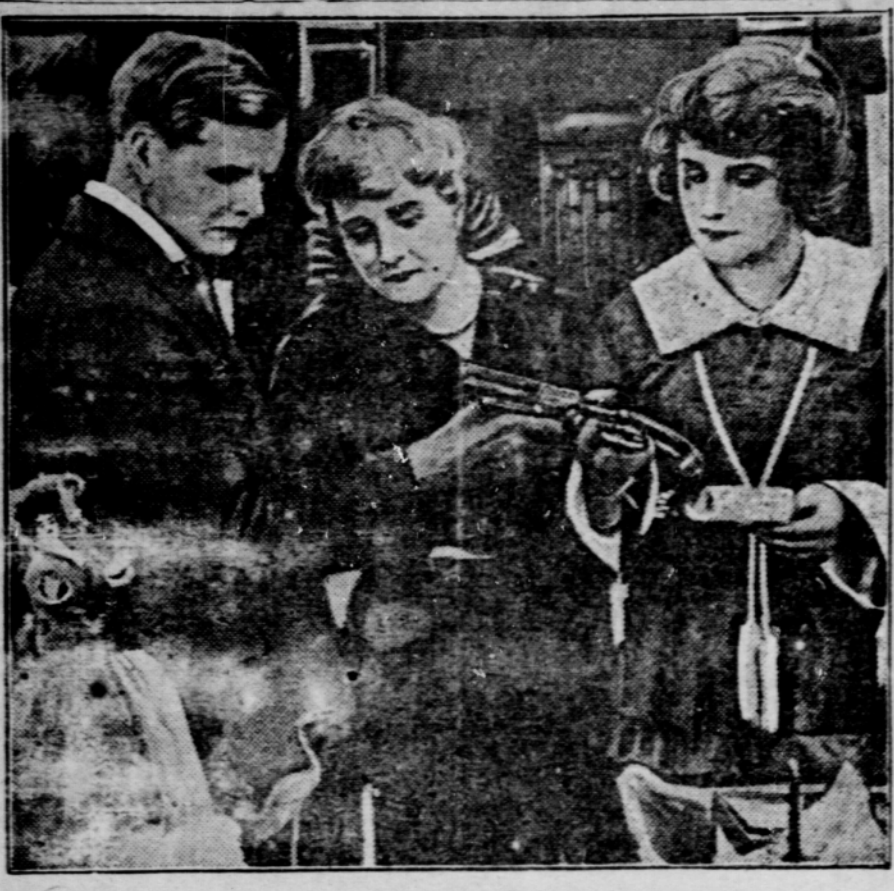
"Let Me See It," I Asked, Taking the Gun.

THE observance of Easter Sunday dates back to the founding of the early Christian church, in commemoration of the resurrection of Jesus. It is generally believed by all Christians that Jesus was crucified on Friday and buried. The following Sunday certain women of Judea went to the tomb early in the morning to anoint his body.