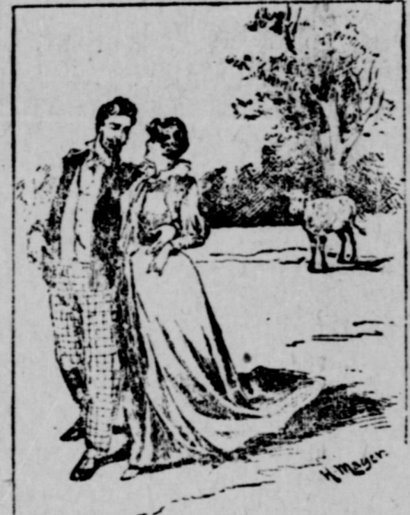
THEN THEY WENT AWAY AND I STOOD WONDERING.

Then they went away, and I stood wondering and wishing that I knew what a critic was like, that I might tell