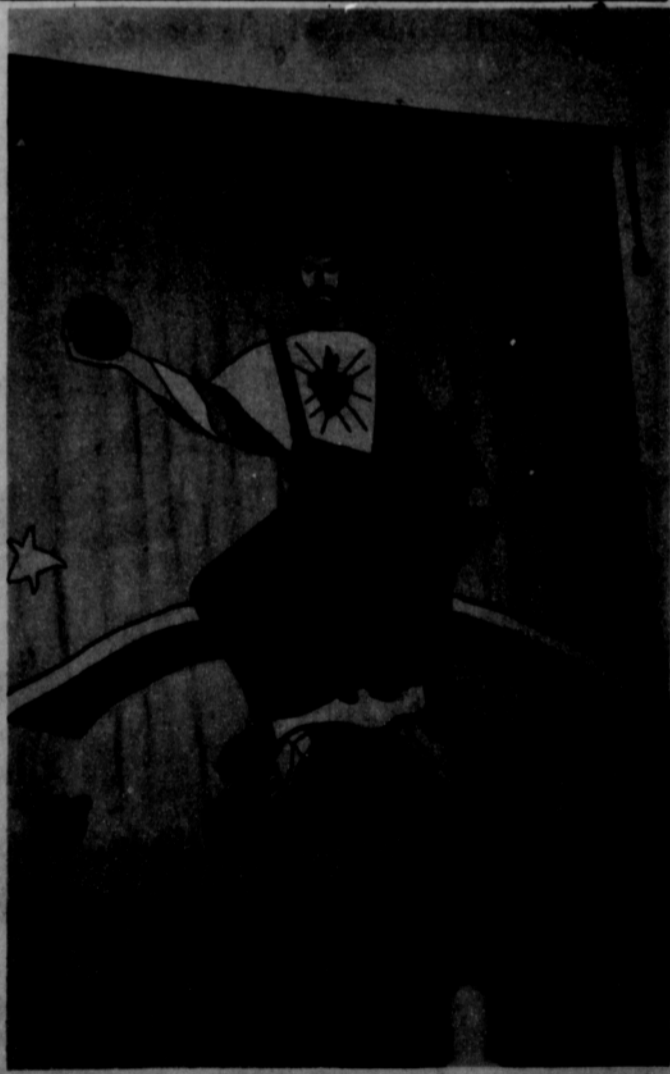
TAPESTRY -- This large tapestry is hanging on the east wall of the Sacred Heart Catholic Church. It was made by the women of the church after being designed by a Lubbock Artist.

SPEARMAN JAYCEES VS. GRÜVER JAYCEES DONKEY BASKETBALL GAME MONDAY, AUGUST 15 JAYCEE PARK 8:00 P.M.