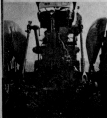
New torsion bar draft-sensing hitches for all rear mounted tools. Only IH offers both 3-point and 2-point hitches.