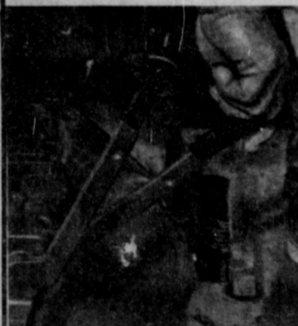
New dual levers for remote hydraulics are in easy reach for instant control. Quick couplers for easy attaching.