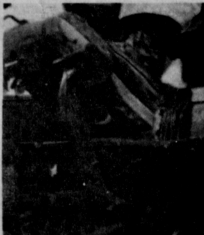
Dyna-Life clutch. Far outlasts any clutch ever used in IH farm tractors. Light pedal pressure; smooth, sure.