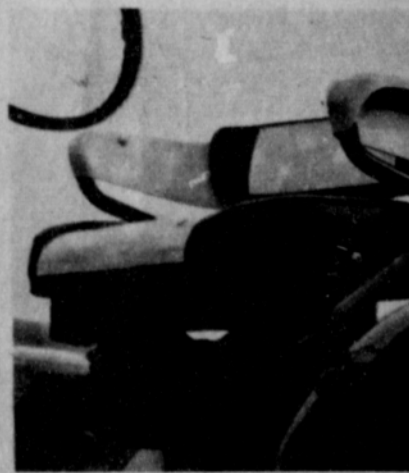
Total Power in total comfort. Seat "floats" your weight, fits your height, slips up and back for stand-up work.