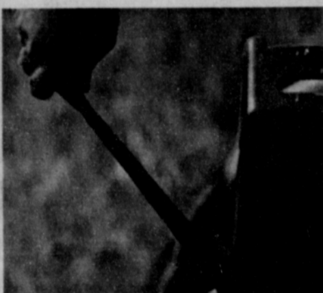
New power-shift independent PTO. Easy engaging for quick shift or feathering of heavy PTO loads.