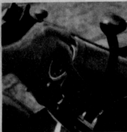
New 16 speeds forward with power shift. Most in any farm tractor. In-line shifting. No guess-work.