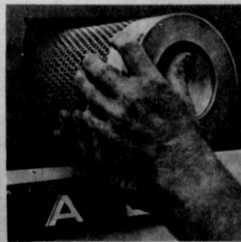
New dry air filter. No messy oil. Self-unloading. Filters better—less engine wear. Cleaner air for full power.