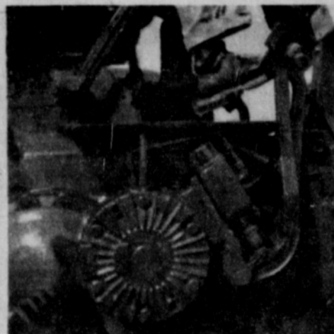
New hydraulic power disc brakes. Self-adjusting. Equalized braking pressure. Handy to service if ever needed.