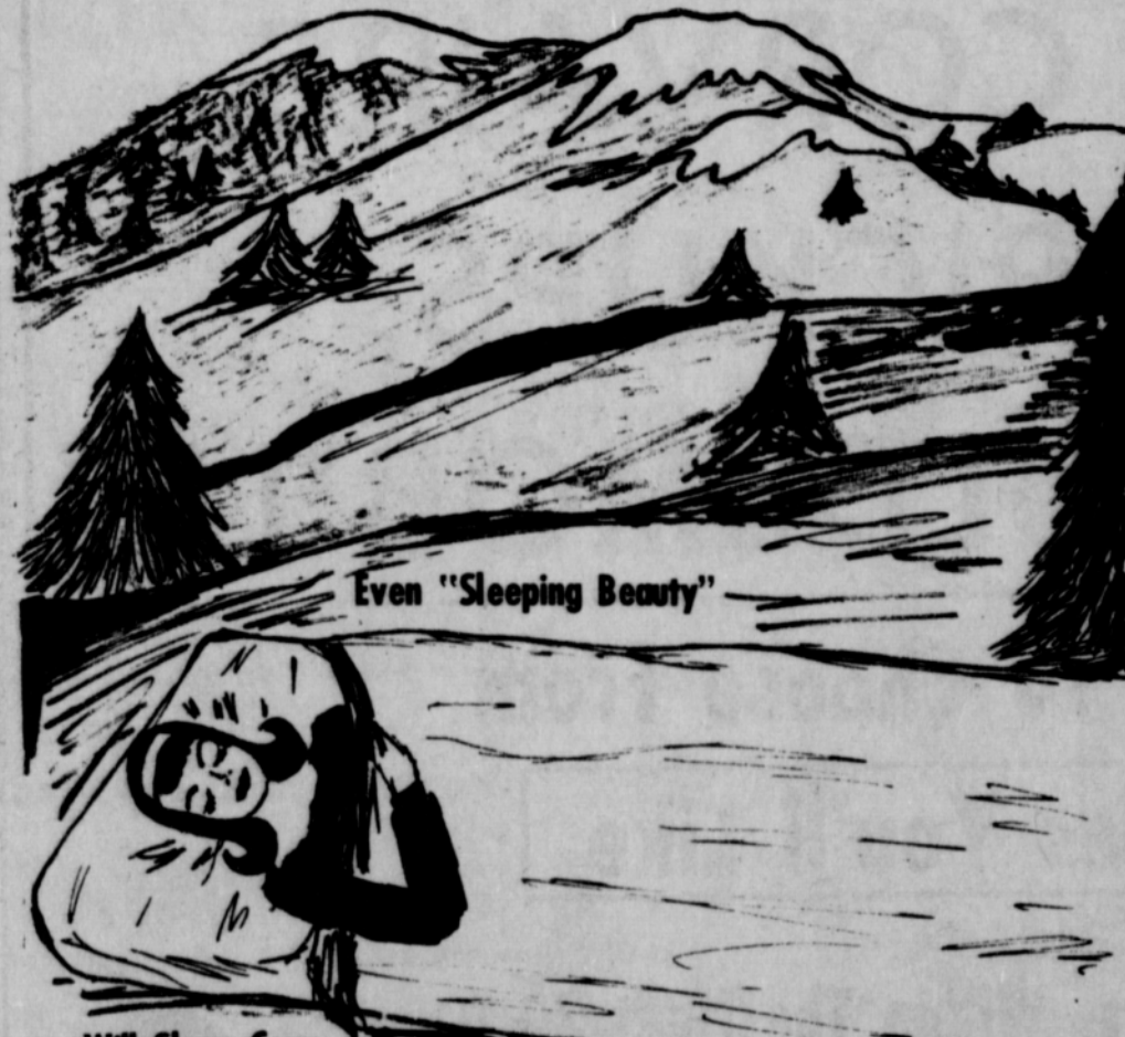
Even "Sleeping Beauty"