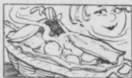
Aluminum foil under the napkin in your roll basket will keep the rolls hotter longer.

As the discussion came to the first of two public hearings for citizen input on for what the city should request the grant money, no action was taken.