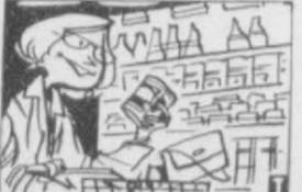
How much you have to pay for food—and how much food there is available could depend in part on how much herbicides American farmers use. Fortunately, a government report shows one popular herbicide is safe to apply.