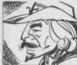
George Custer was the youngest American man ever to make rank of General in the American army—he achieved that by age 23.