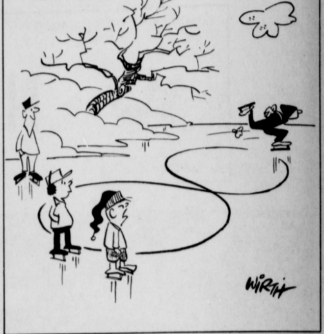
"That show off! He can skate out a figure 8, but I'll bet he can't even count that high."

Want To Build a New Home, Remodel or Repair Your Home ?