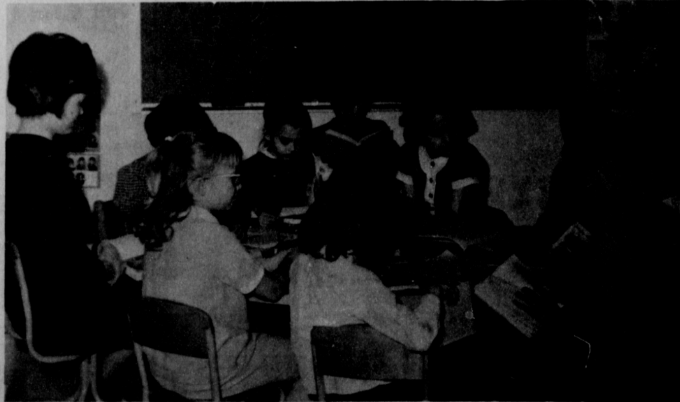
READING CIRCLE--These third graders are in their reading

SEE THE HANSFORD PLAINSMAN THURSDAY FOR MORE SALUTE OF VALUES