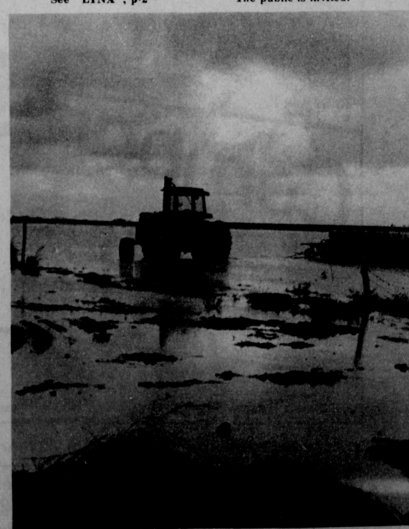
HEAVY SEPTEMBER RAINS have fields across Hansford County standing in water with over 5-inches of moisture reported so far for the month.

September temperatures remain in the moderate range this year. however, with lows in the mid-50's to low 60's. Highs recorded for September generally fall in the